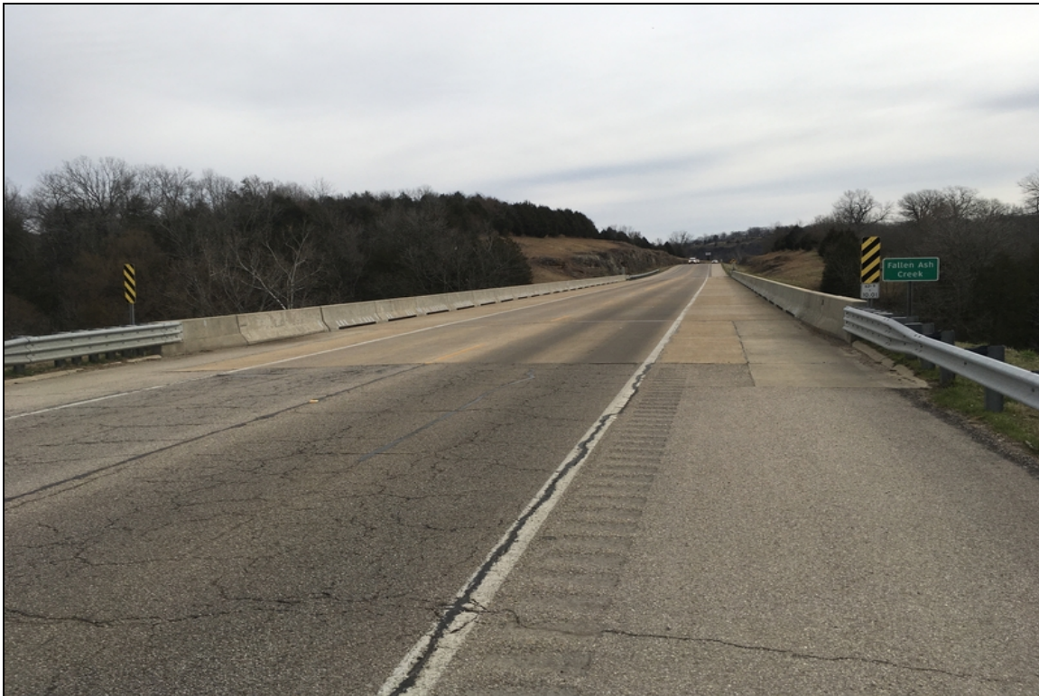
Approach view in direction of log mile.