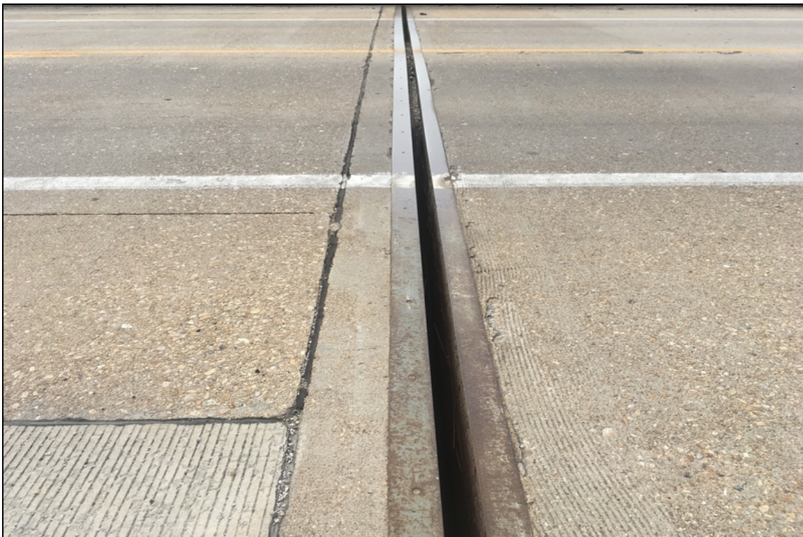
Abutment #2 compression joint seal condition.