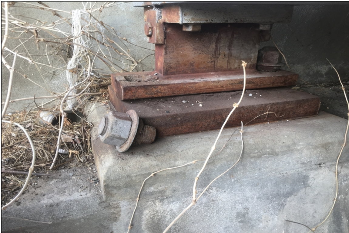
Abutment #1 beam #6 anchor bolt broken.