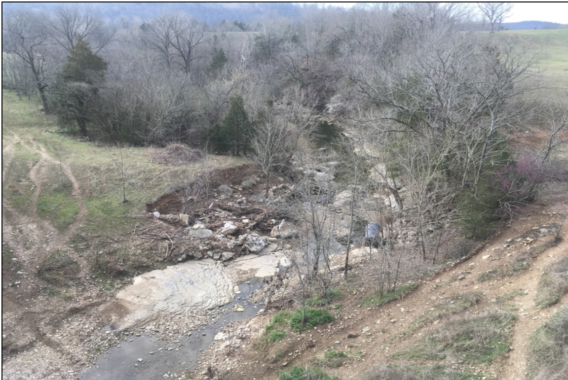
Downstream channel view.