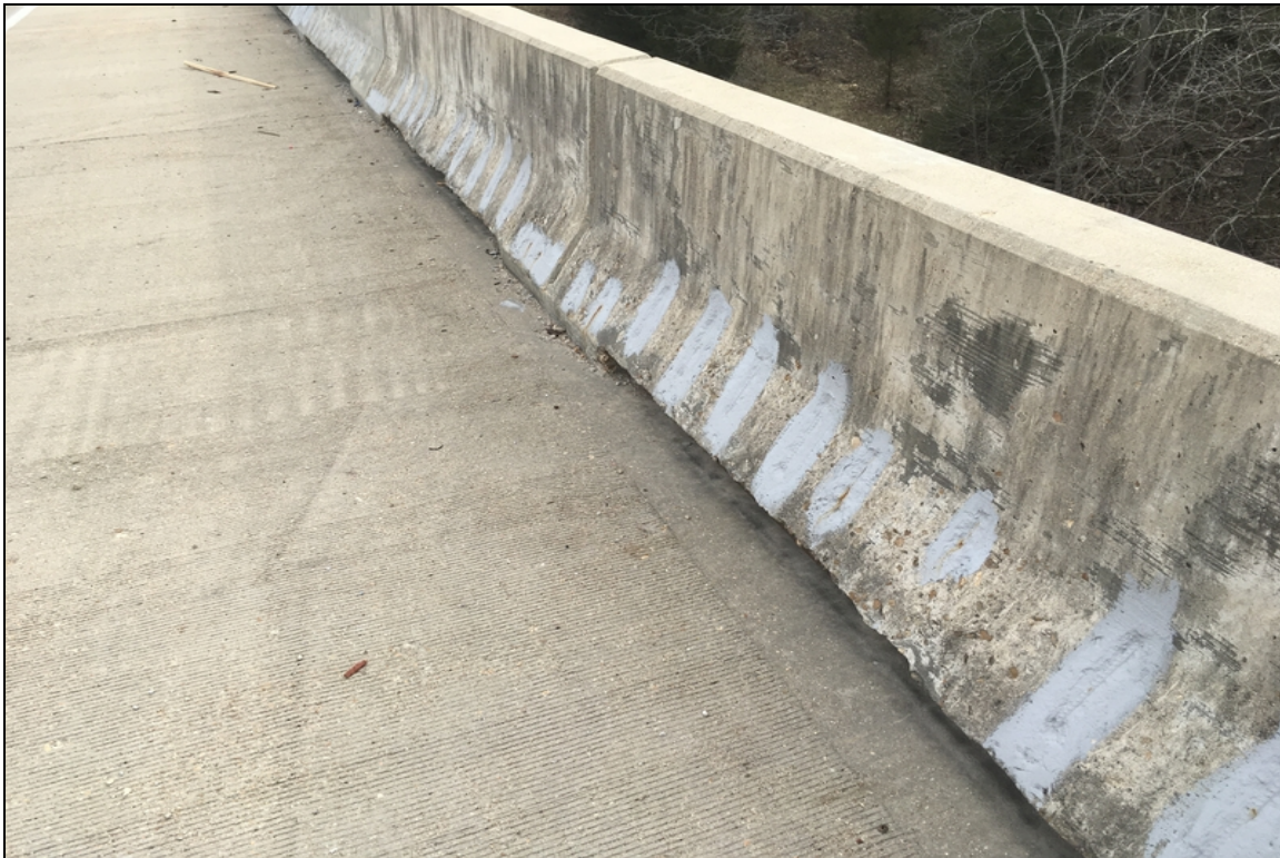
View of exposed rebar that has been painted on the parapet wall. Typical