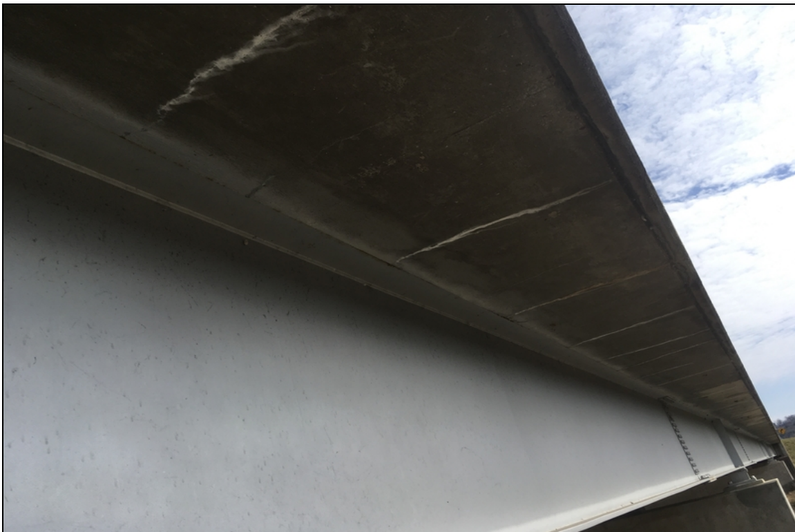
Transverse efflorescence on the left and right deck overhangs.