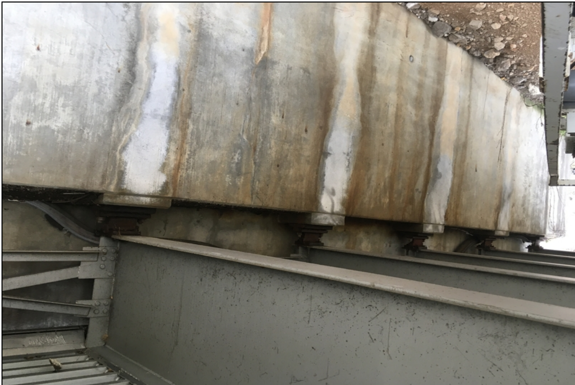
Bearing and joint seal condition at abutment 2.