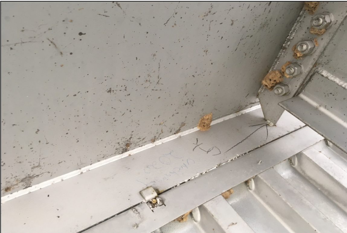
Cracked upper diaphragm weld in bay 5 in span 2 at diaphragm 4 ahead of pier 1. Unchanged since last inspection.