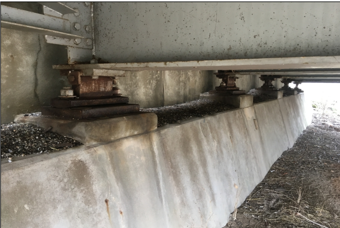
Bearing condition at abutment 1.