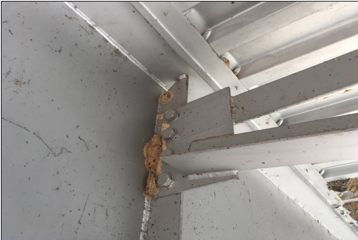
Tack Weld detail at the top of the diaphragm connections. Typical of all diaphragm connections at all locations. Only the #2,3 diaphragms are welded at the top in span #1.