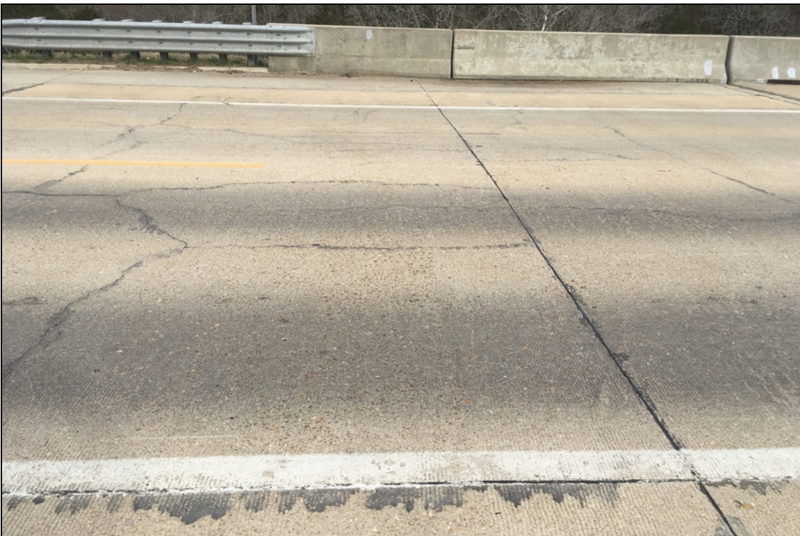
View of abutment 1 approach slab.