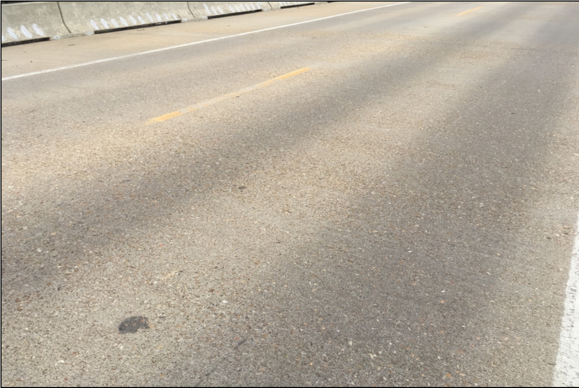
Typical view of driving surface.