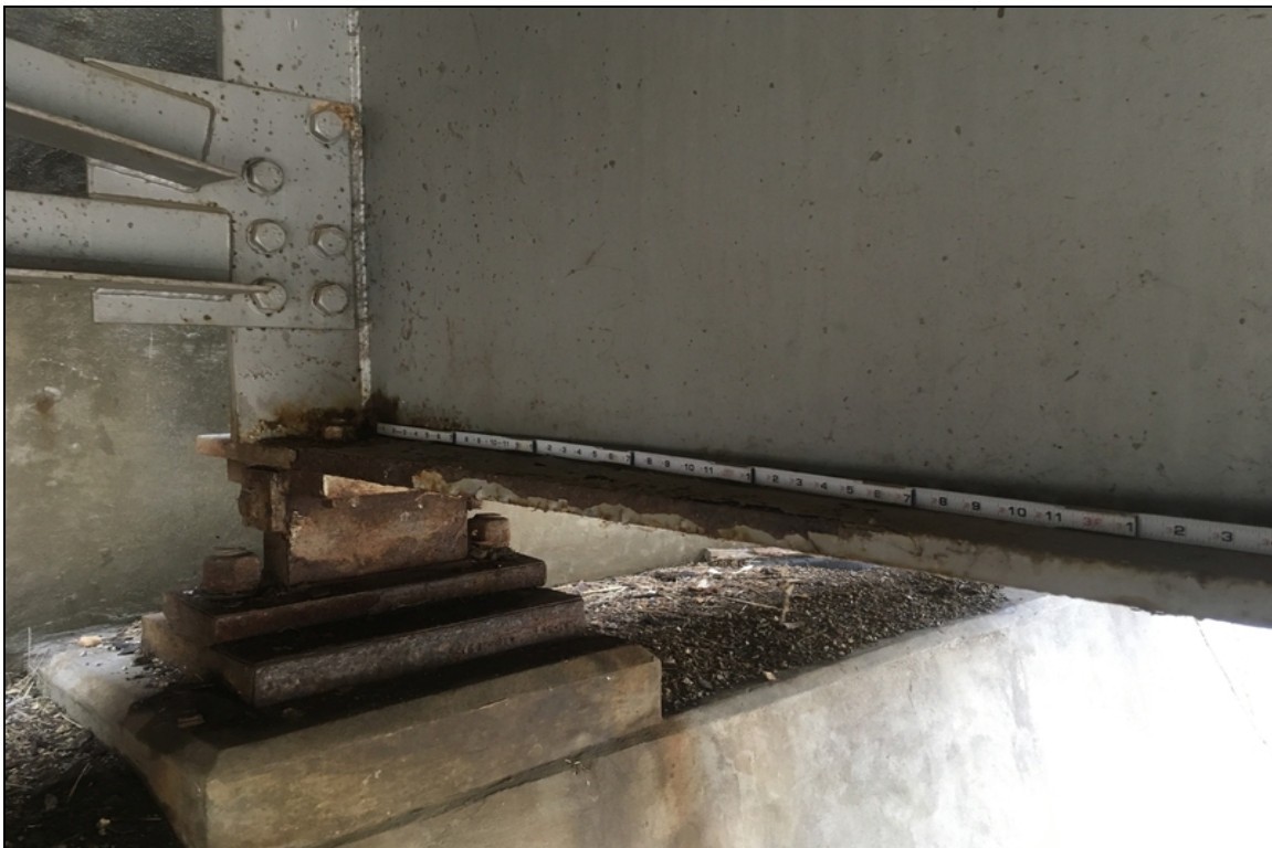
Corrosion on the bottom flange of beam #2 over abutment #1. Typical of beams 2-4.