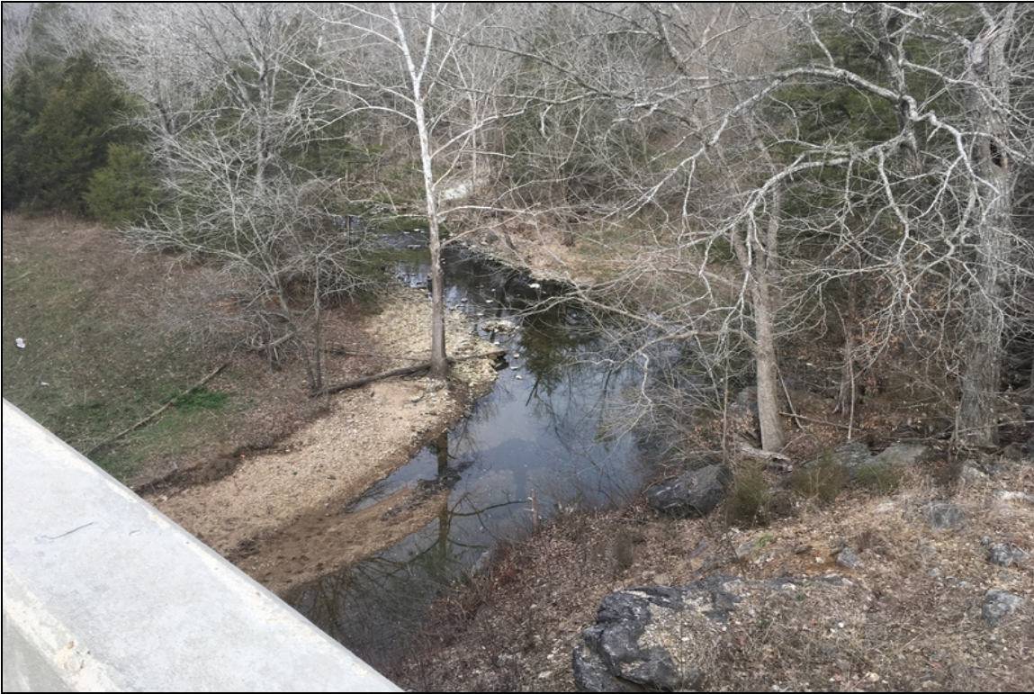
Upstream channel view.