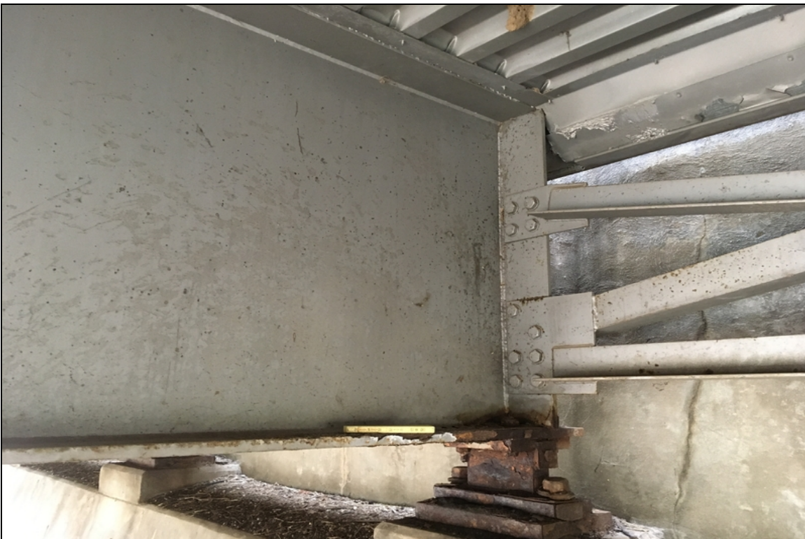
Typical beam end corrosion at abutment 1 from missing joint seal.