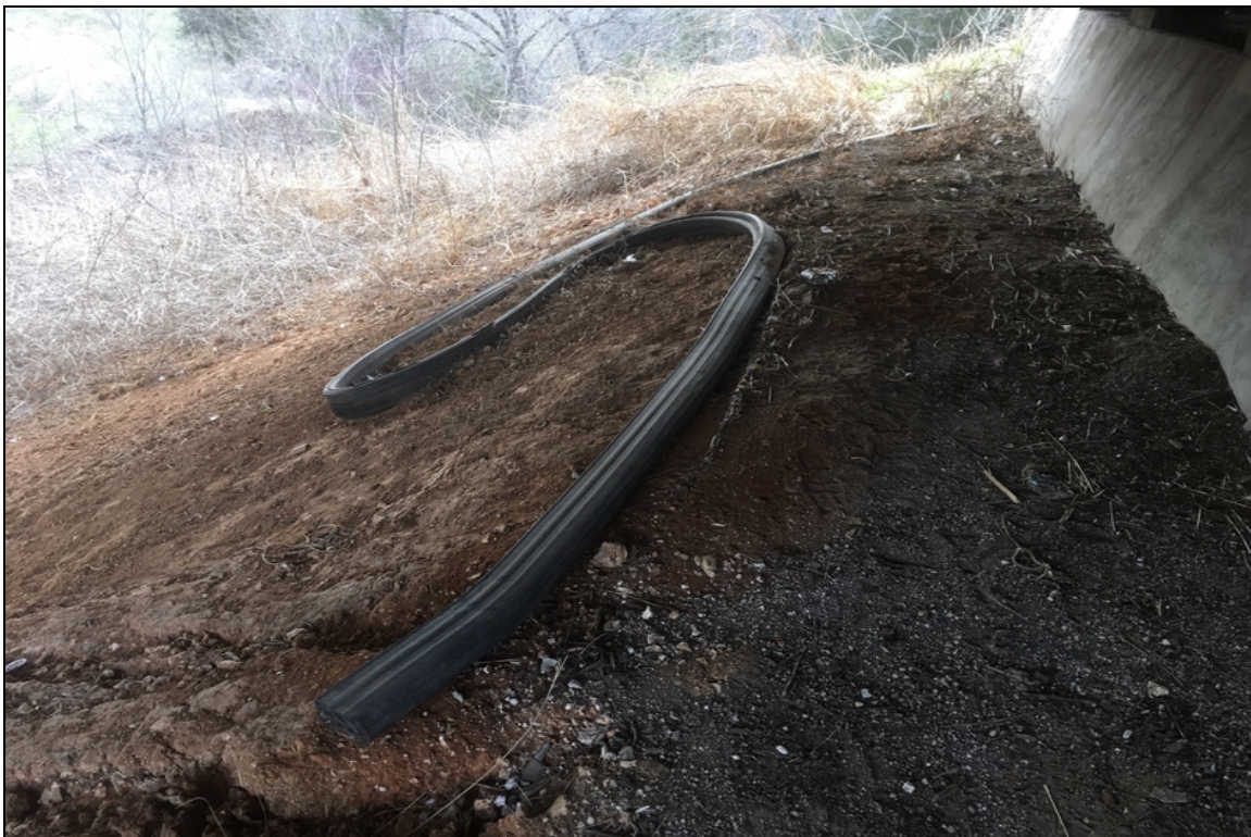
Compression joint seal on the abutment #1 embankment.