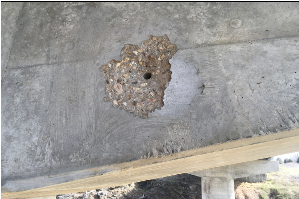
Spall on the right pier cap end of pier #1 on the span #1 side.