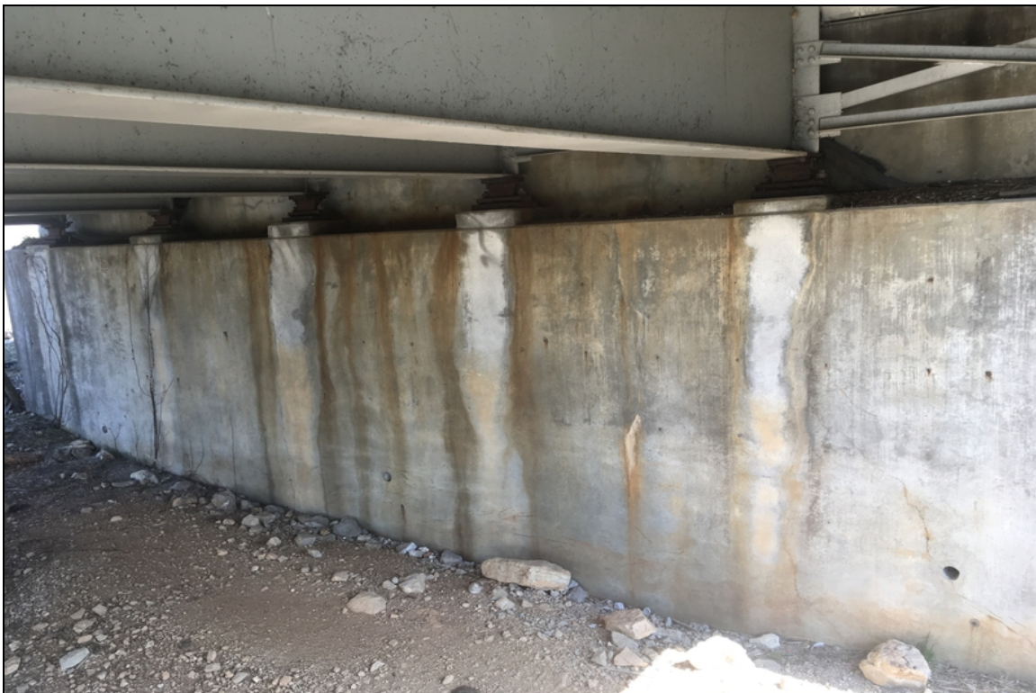
General view of abutment #2.