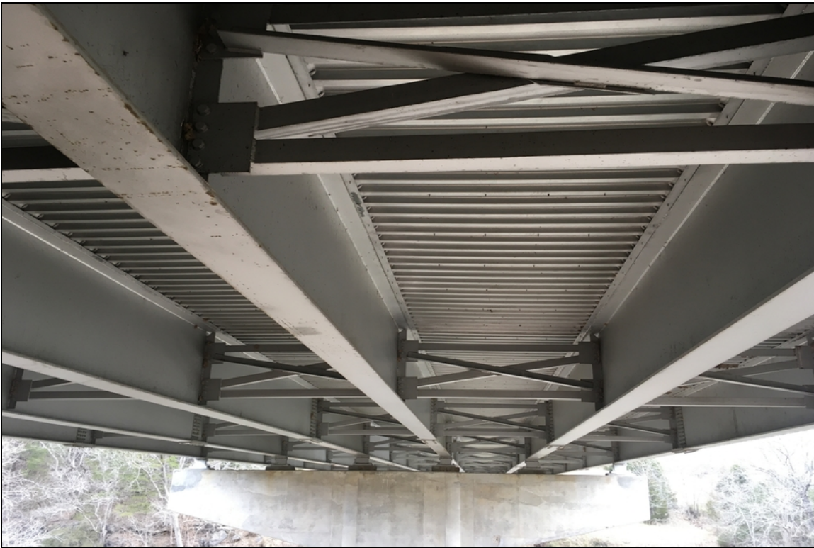
Typical view of the undersurface.