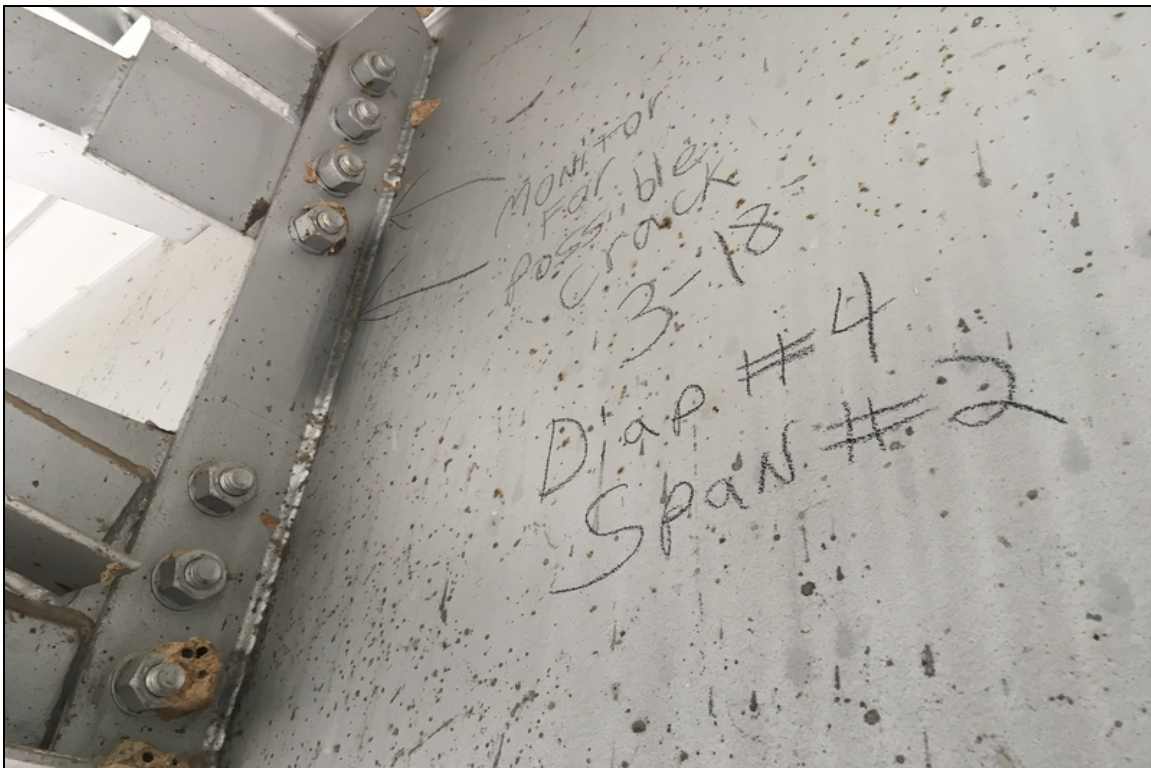
Possible vertical crack in the diaphragm connection plate at diaphragm #4 span #2, bay #3.