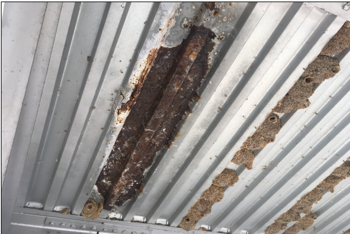
Sip corrosion in span #2 bay #5 over the first field splice area.