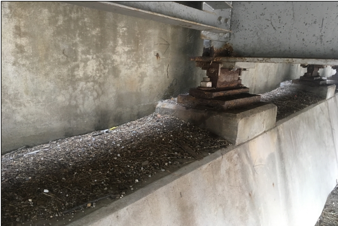
Build up on the bridge seat at abutment #1 due to missing joint seal.