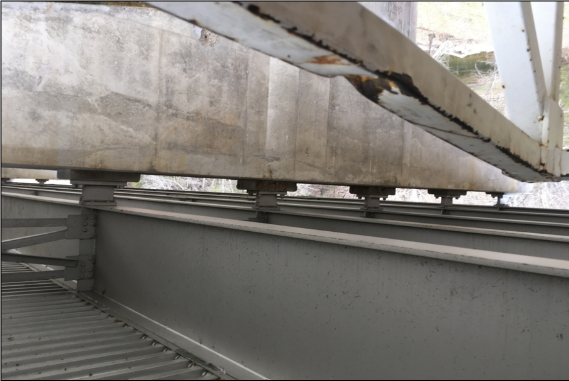
Bearing condition at pier 1.