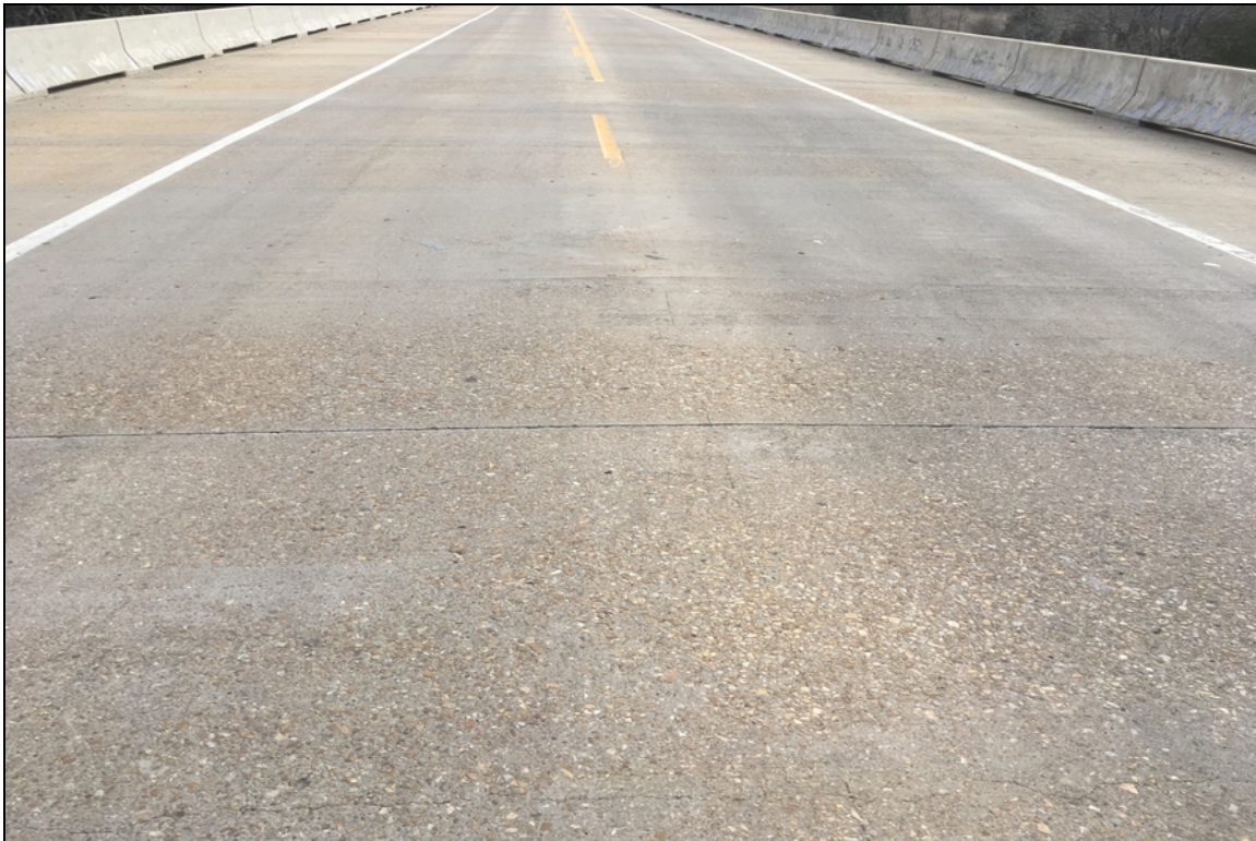
Typical view of driving surface.