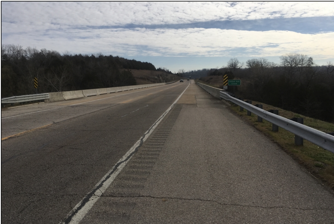
Approach view in direction of log mile.