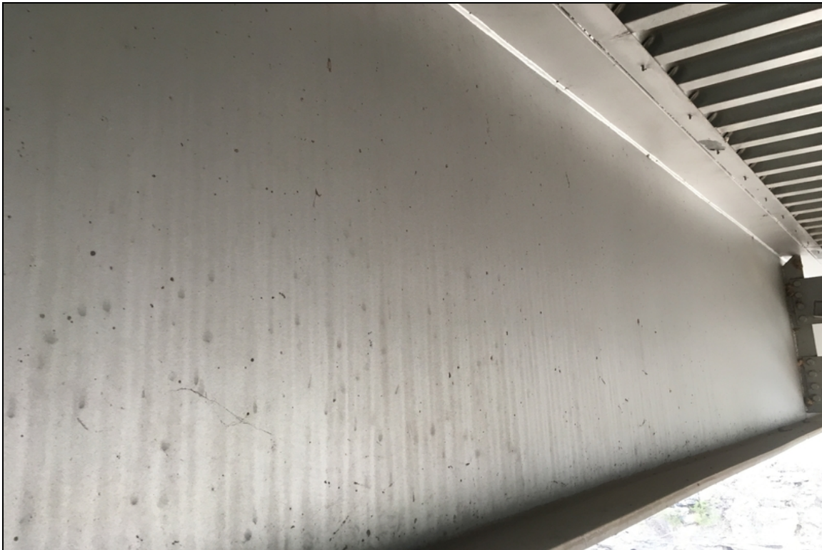
Typical paint condition. Loss of gloss with no chalking.