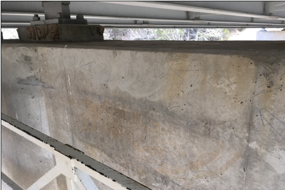
Typical hairline cracking in the pier caps.