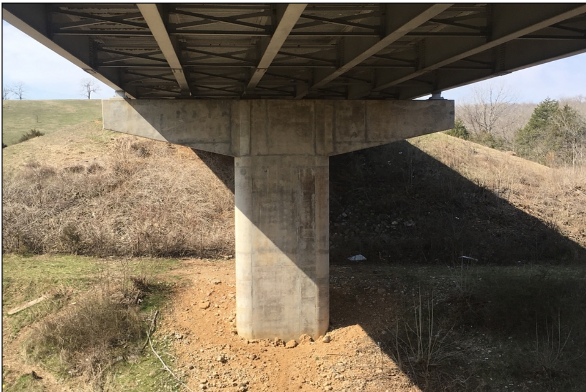
Typical view of piers.