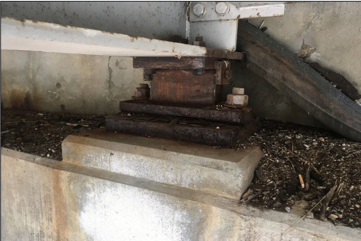
Moveable bearing condition at abutment #2. Typical of all 6 bearings.