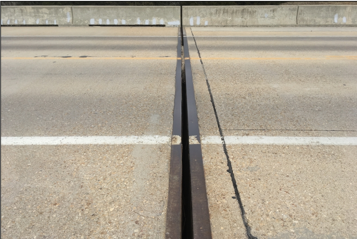
Compression joint seal is completely missing at abutment 2 except for 10' at the center line that is debris impacted.