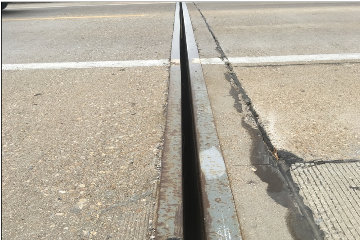
Abutment #1 compression joint seal condition.