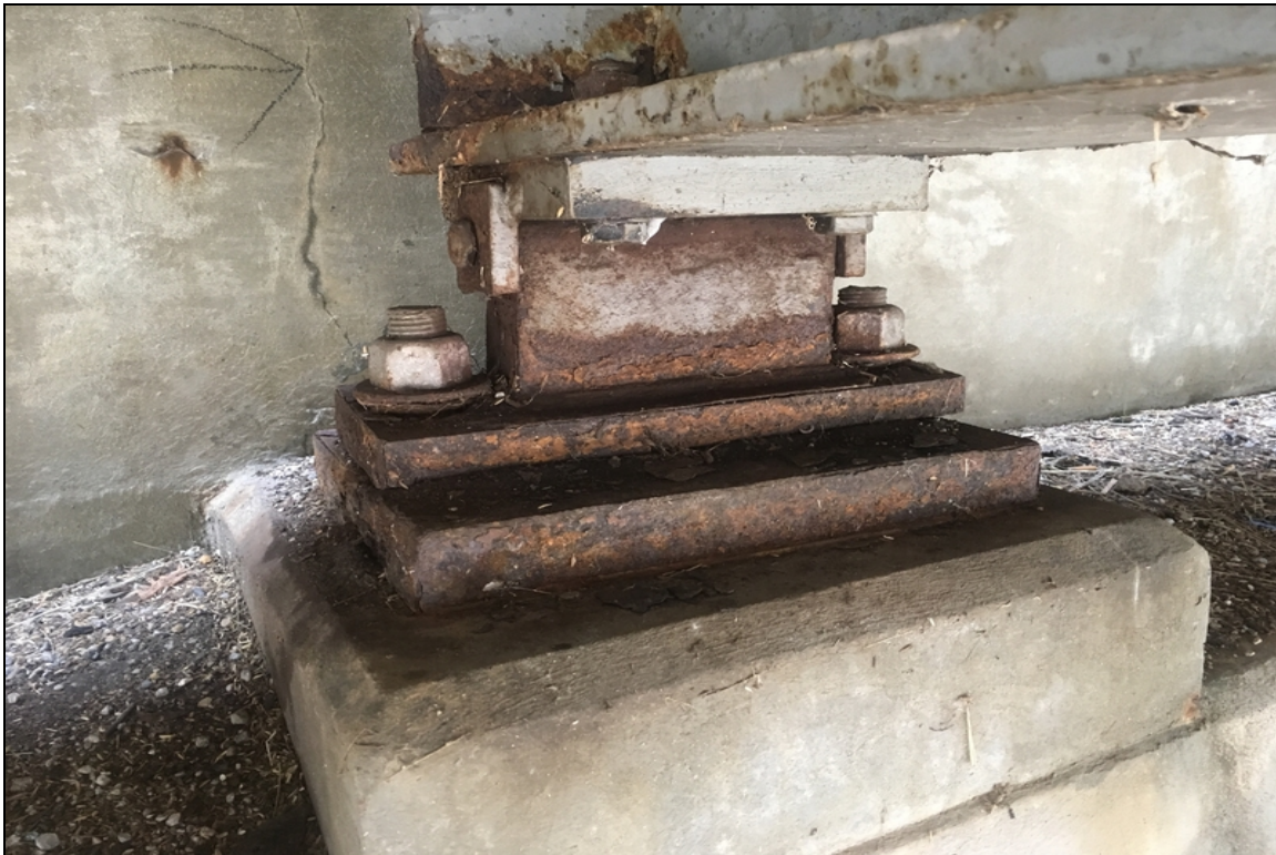
Moveable bearing condition at abutment #1. Typical of all 6 bearings at this location.