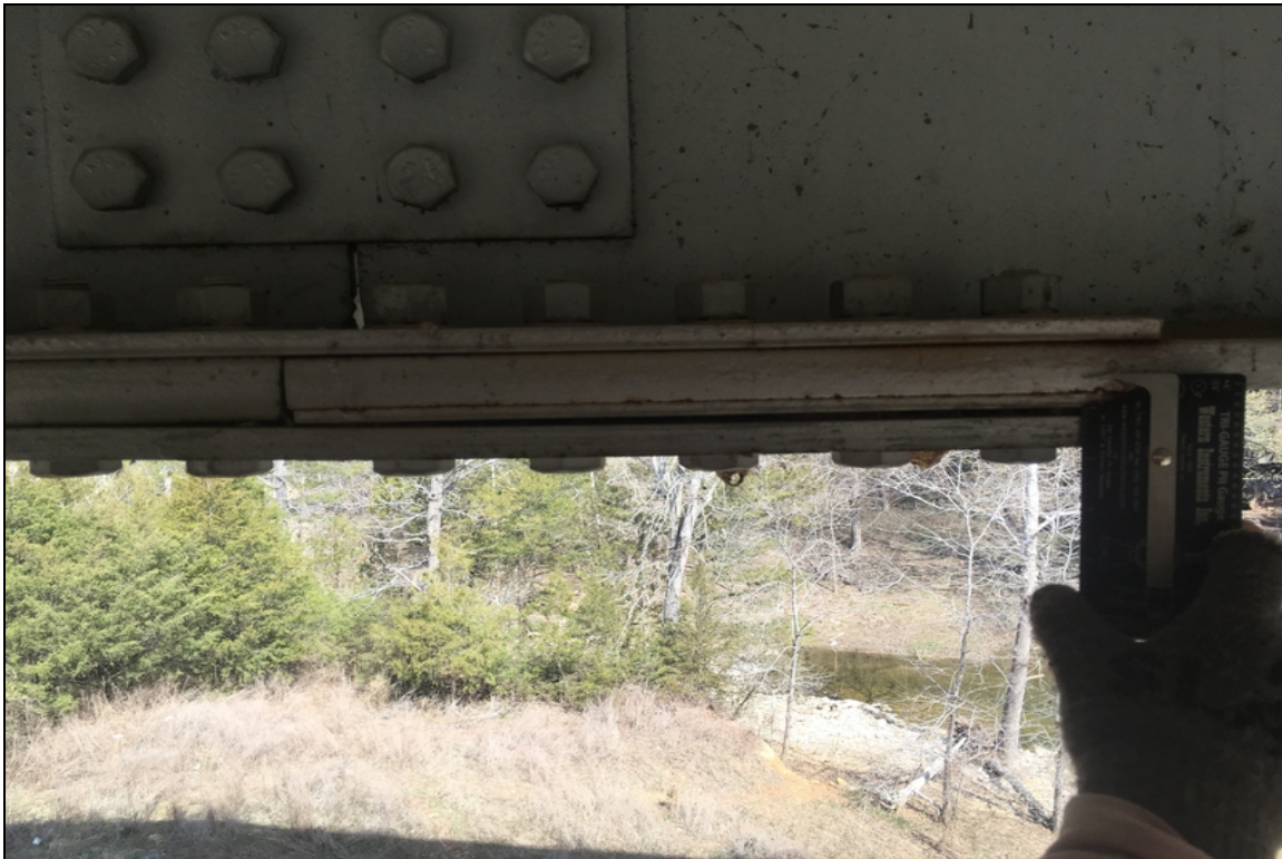
1/8" gap on the bottom flange connection plate at the first field splice on beam #4 in span #2. Due to not being completely tightened.