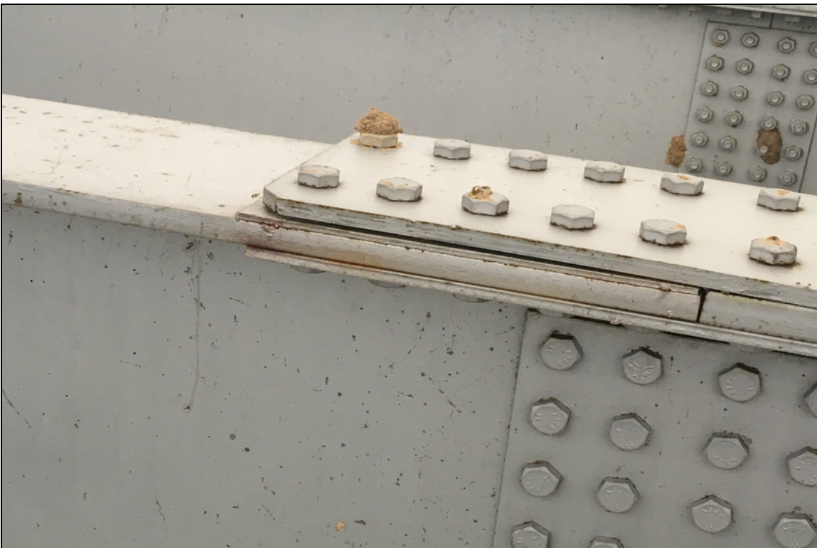
Cracked tack welds on beam 3 in span 2 at the first splice panel.