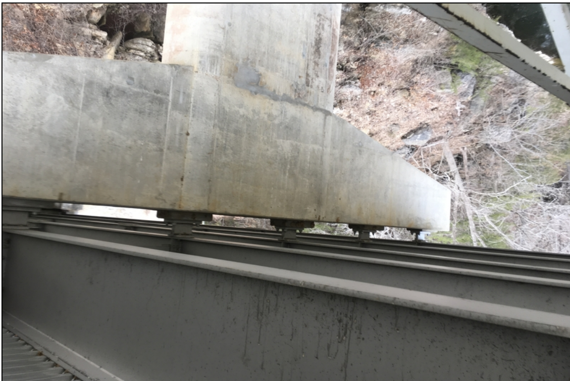
Bearing condition pier 2. Typical.