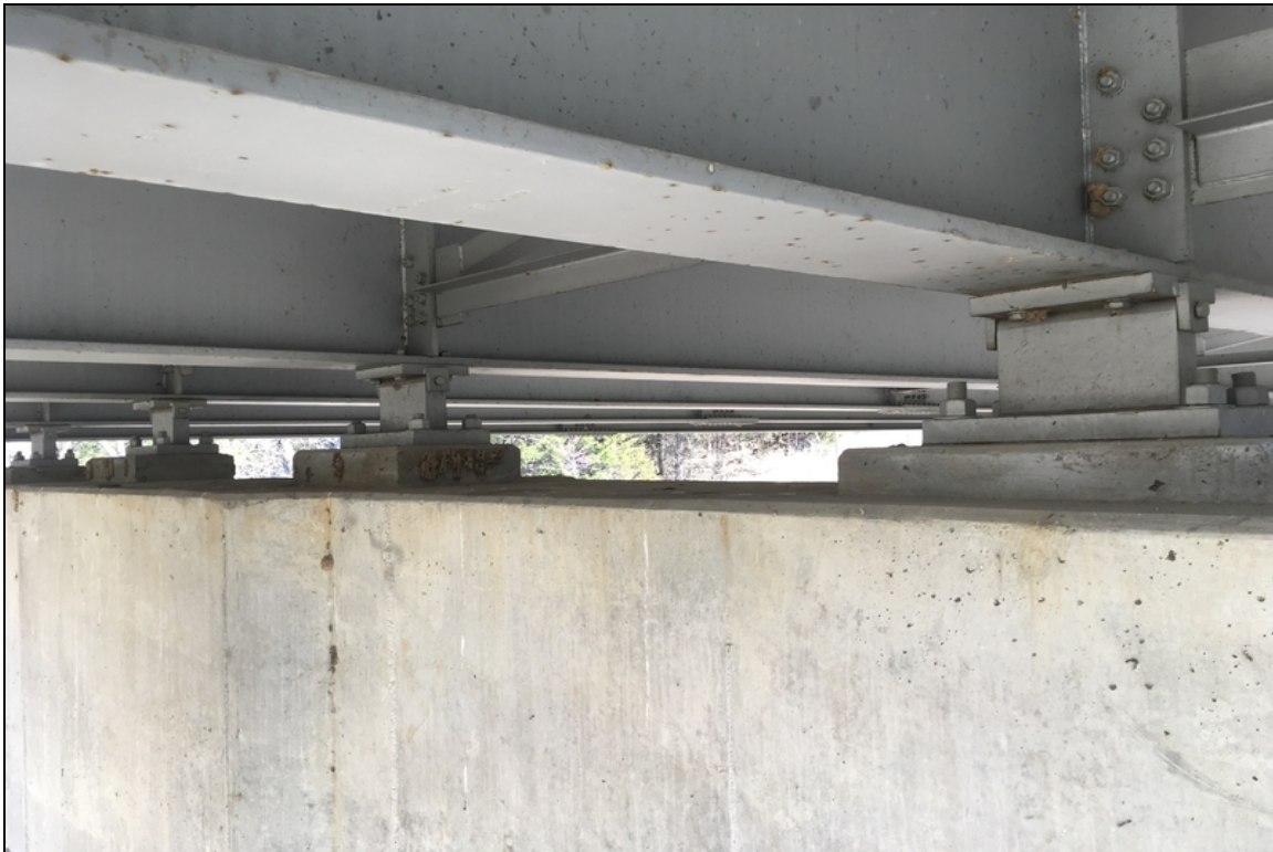
Fixed bearing condition at pier #2.