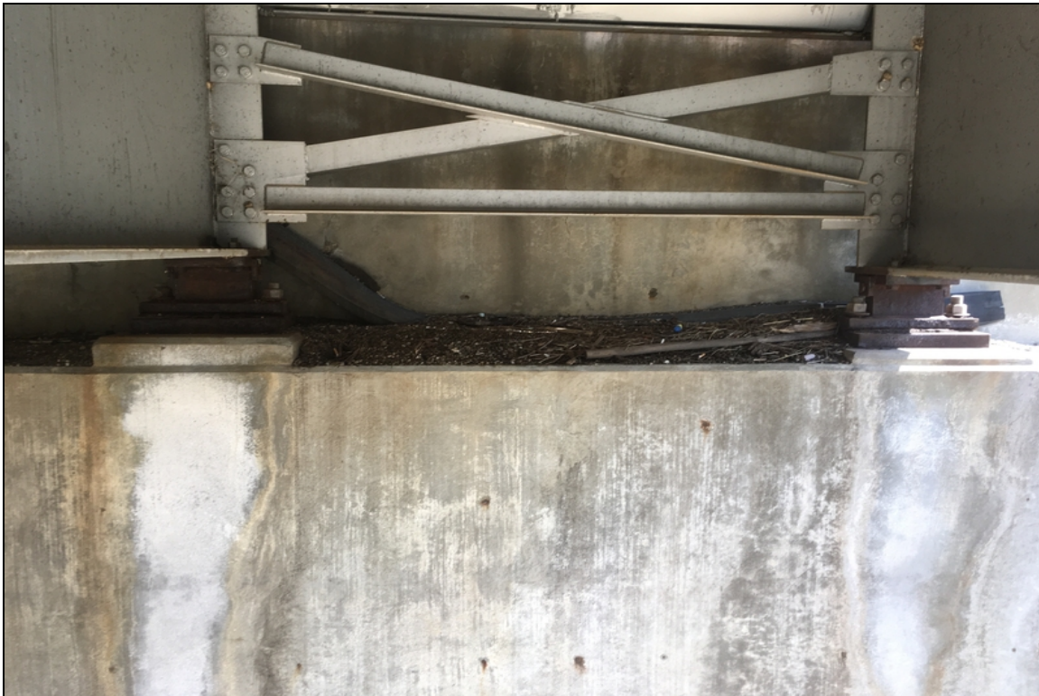
View of build up on the bridge seat at abutment #2.