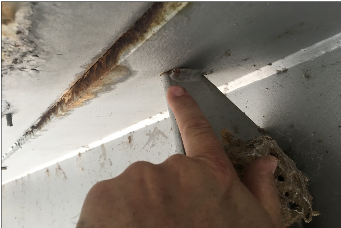
Cracked tack weld at the top of the #3 diaphragm connection in span #1 bay #5. Typical also of diaphragm 3, in bay 5 and dia. 4 in bay #4 span #2,