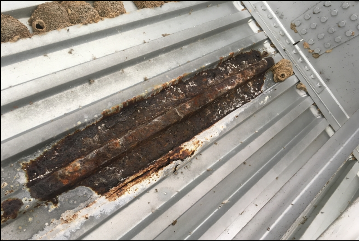
Sip corrosion in bay 5 of span 2.