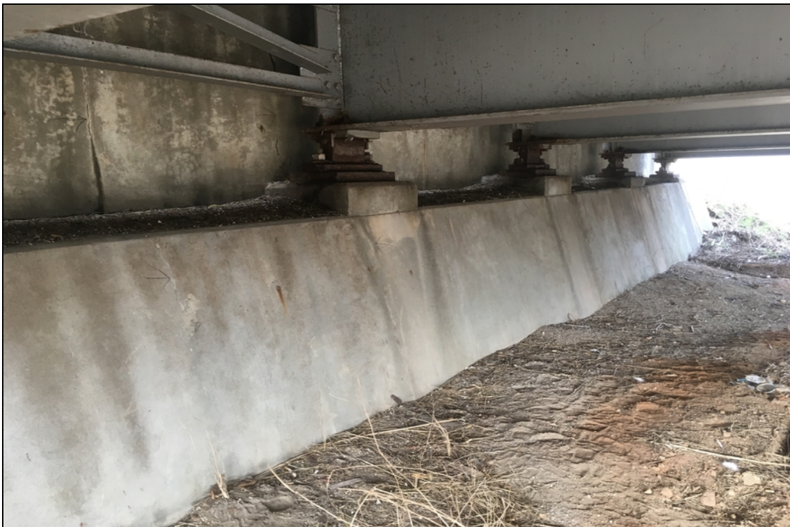
General view of abutment #1.