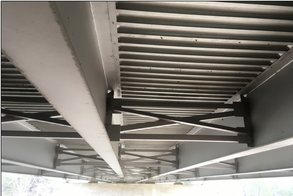
General view of the undersurface.