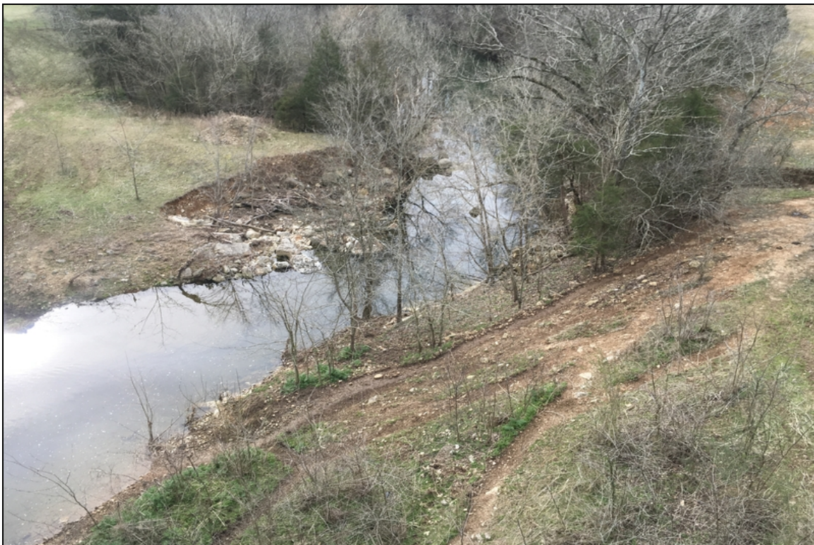
Downstream channel view.