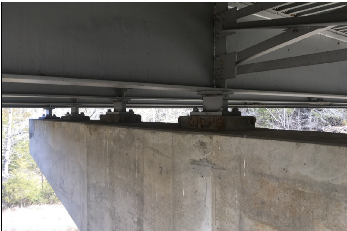
Fixed Bearing condition at pier #1. Typical of all 6 at this location.