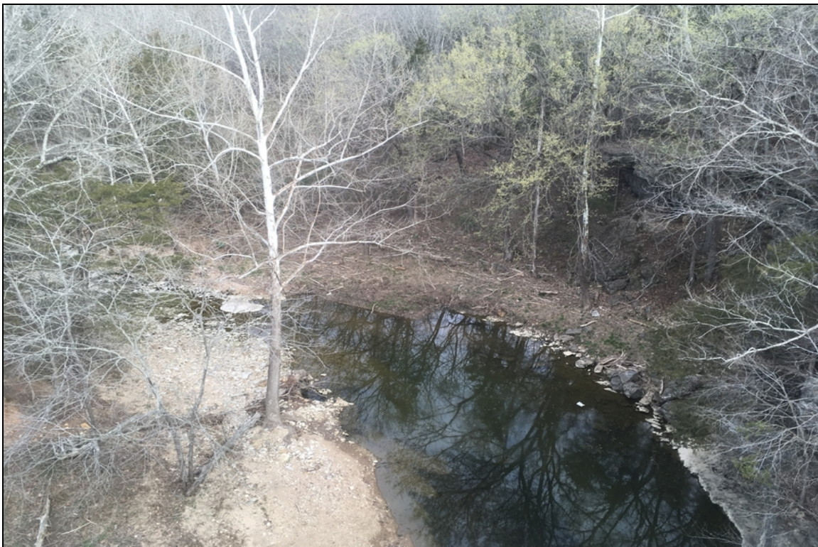
Upstream channel view.