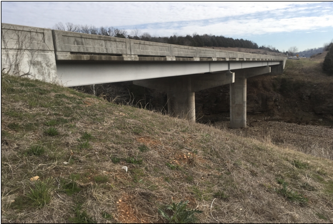
Elevation view. Log mile from left to right.